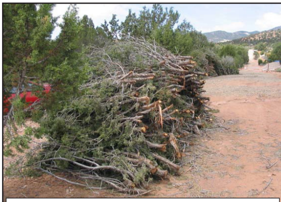
Good example of stacked piles for chipping.