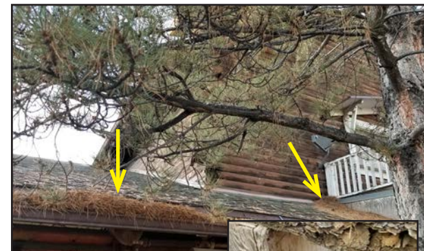
Needles and leaf litter in your gutters, on corners of roofs, and under stairs and decks can be easily ignited by landing embers.