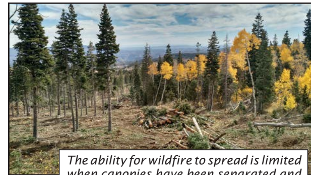
The ability for wildfire to spread is limited when canopies have been separated and branches have been limbed up.